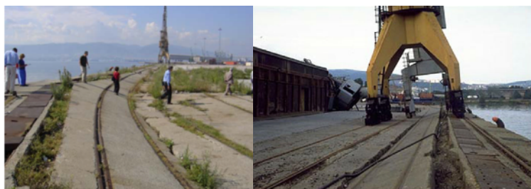
Damage of the quay wall at Derince Port due to liquefaction of the backfill after 1999 Kocaeli earthquake.