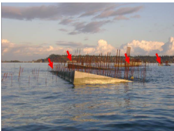
Four concrete caissons sunken due to seabed liquefaction induced by storm waves.